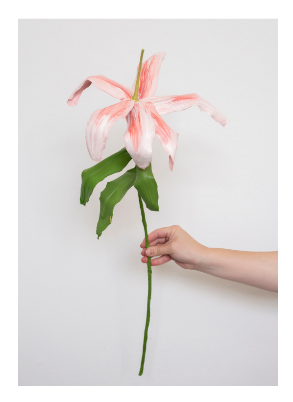
Acrylic paint and galvanised steel wire. Approximate size: 55cm x 25cm Price: R1,900