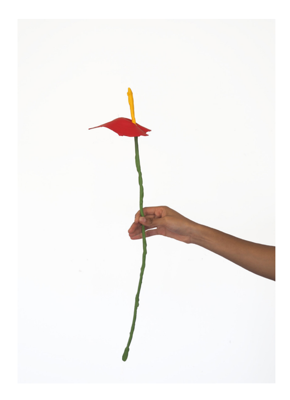
Acrylic paint and galvanised steel wire. Approximate size: 60cm x 10cm Price: R1,200