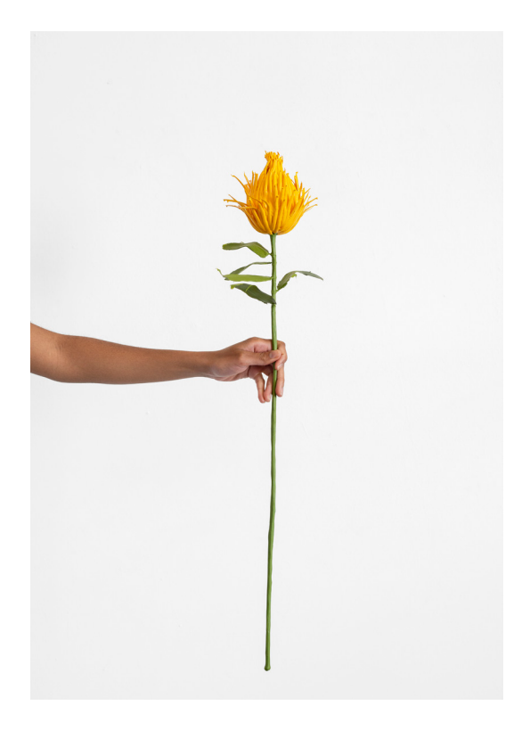
Acrylic paint, styrofoam and galvanised steel wire. Approximate size: 60cm x 10cm Price: R1,900