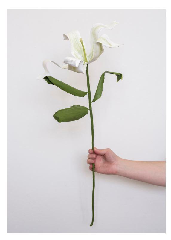
Acrylic paint and galvanised steel wire. Approximate size: 55cm x 25cm Price: R1,900