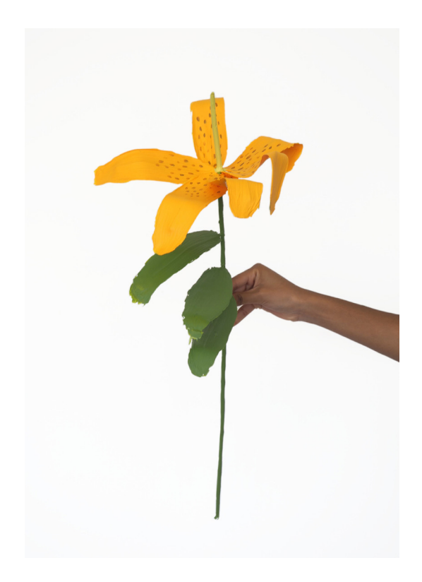
Acrylic paint and galvanised steel wire. Approximate size: 55cm x 25cm Price: R1,900