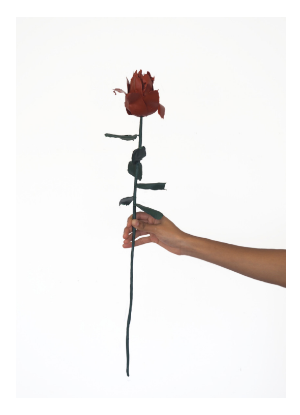
Acrylic paint, styrofoam and galvanised steel wire. Approximate size: 60cm x 10cm Price: R1,500