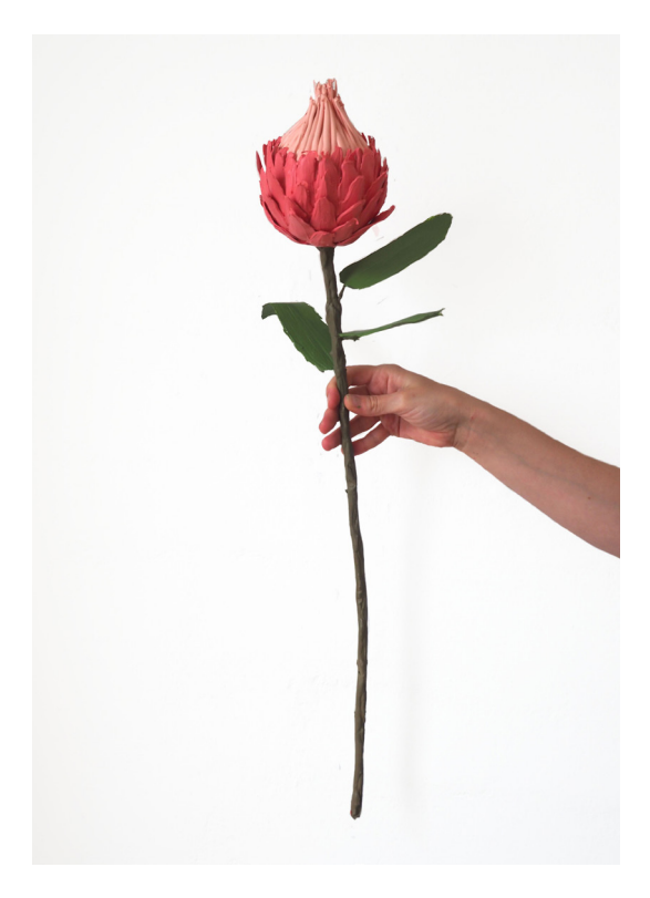
Acrylic paint, styrofoam and galvanised steel wire. Approximate size: 70cm x 15cm Price: R2,200