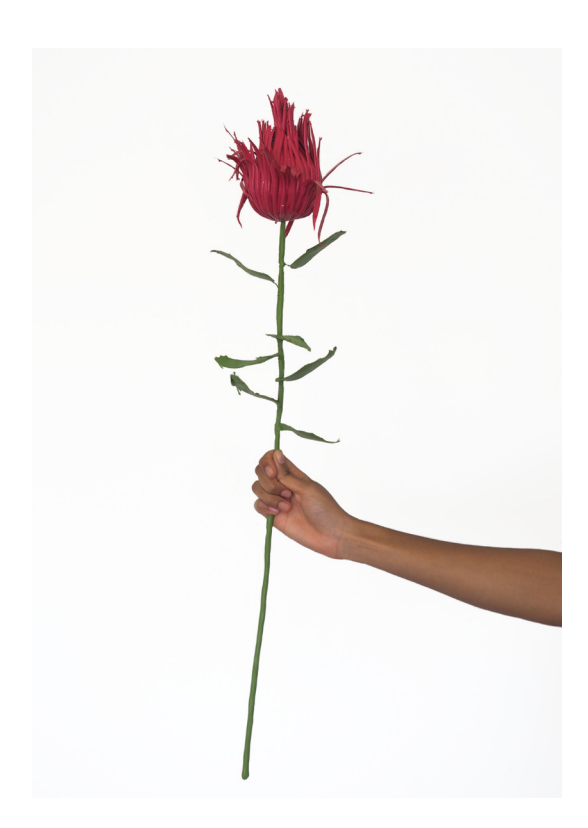
Acrylic paint, styrofoam and galvanised steel wire. Approximate size: 60cm x 10cm Price: R1,900