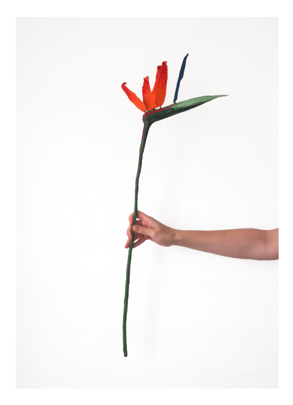
Acrylic paint, styrofoam and galvanised steel wire. Approximate size: 70cm x 15cm Price: R1,900