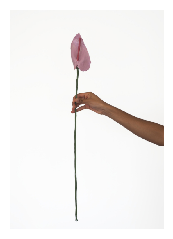
Acrylic paint and galvanised steel wire. Approximate size: 60cm x 10cm Price: R1,200