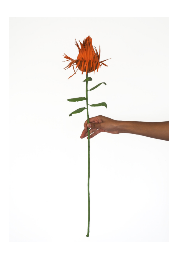
Acrylic paint, galvanised steel wire and styforoam. Approx. 10 \times 70 \text{ cm} .