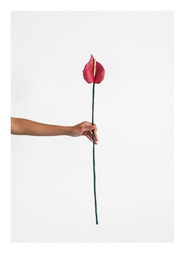
Acrylic paint and galvanised steel wire. Approximate size: 60cm x 10cm Price: R1,200